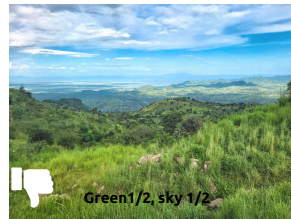
Green 1/2, sky 1/2